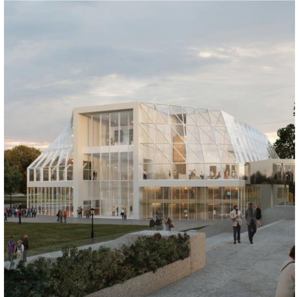
Buffalo AKG Art Museum