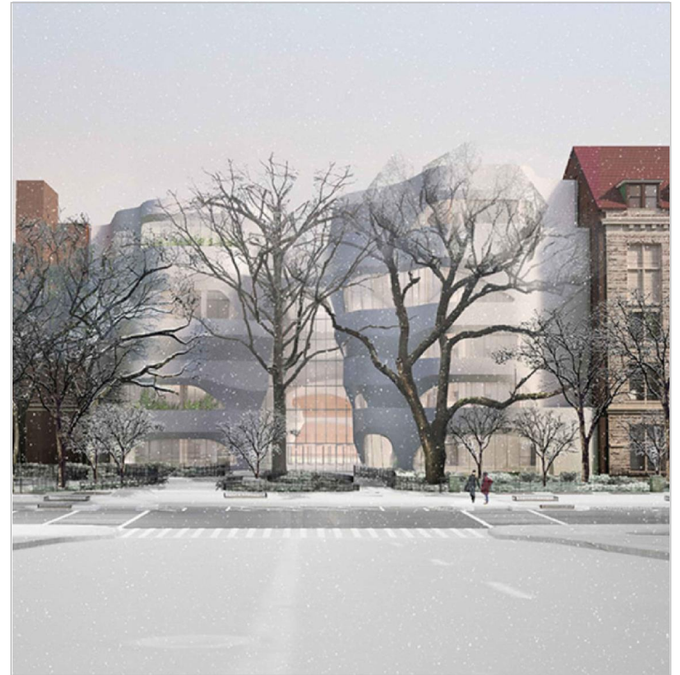
AMNH Gilder Center NYC