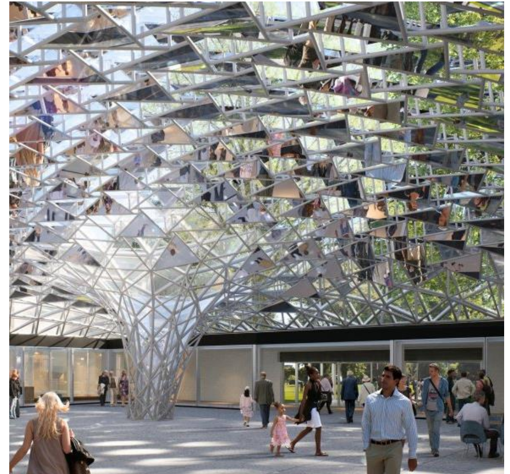
Buffalo AKG: Common Sky